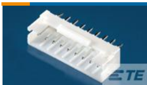
TE Part # 1-1735446-1 2MM PITCH HPI POST HEADER, VERTICAL, 11P